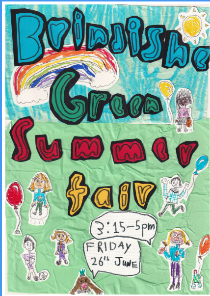
Key Stage 1 Winner: Luna, Parakeet