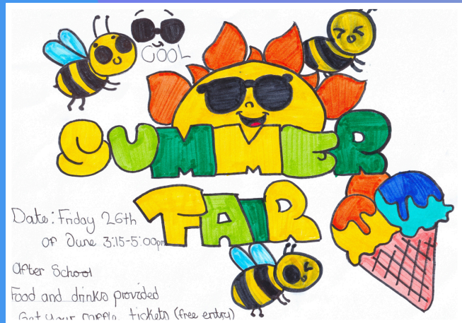
Key Stage 2 Winner: Elissa, Hornbill