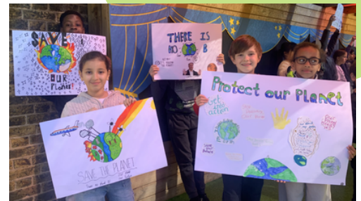
Whole School Protest, Song and Dance