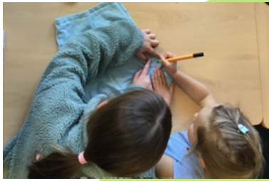
Bag Making - T-shirt Upcycling!