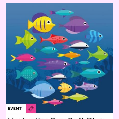
Under the Sea Soft Play 5 May - 3 September This summer we are making a splash with the creation of our...